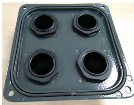
Fig.3. Spare AC Sealing Plate